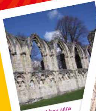
Figure 4: Abbey ruins

This tour includes York Minster, all four Bar Towers on the City Walls, The Shambles, Clifford's Tower, and much more, including secret parts of Medieval York.