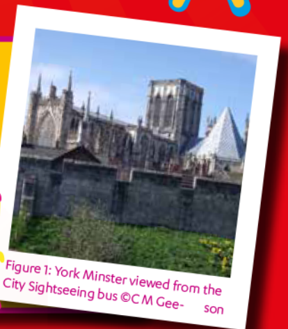
Figure 1: York Minster viewed from the City Sightseeing bus