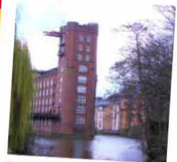
Figure 7: Railway HQ