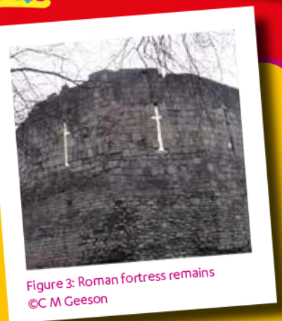
Figure 3: Roman fortress remains

* Addition costs apply to attraction admittance, but offered at a discounted rate as part of the tour