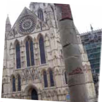
Figure 2: Roman column

Explore Eboracum, as you find out about life in the fortress and Roman colonia. View the remains of a 2000-year-old fortress and find out what it was like to be a soldier. Listen to the stories of the visiting emperors, as well as the gladiators, ghosts, and multicultural citizens of Roman York.